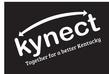
On an angle